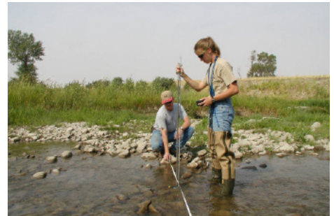
Many conservation districts have developed citizen science water quality monitoring programs.