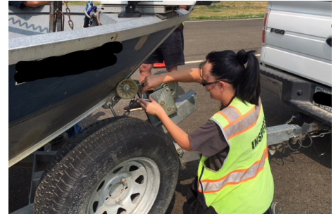
Garfield CD runs the local AIS inspection station. This is just one of the many ways districts assist other agencies.