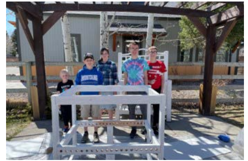
Top: Vermicomposting 2021 Event with Gallatin CD