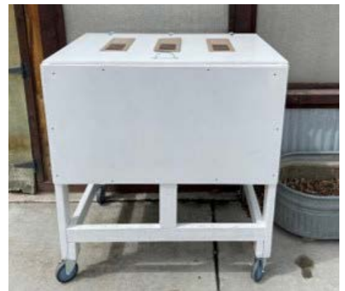
Bottom: Vermicomposting Bin