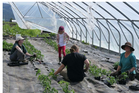
Bottom: Inside Foothill Farm's Greenhouse.